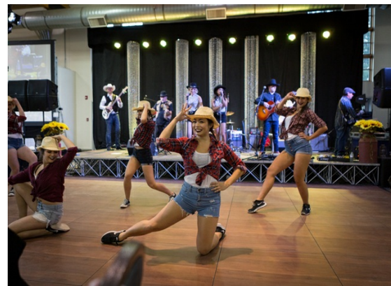
Dancers kicking off the event in style