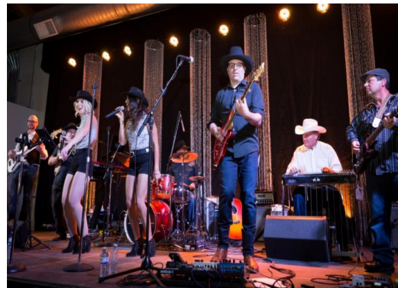
Uptown entertains the crowd all night long